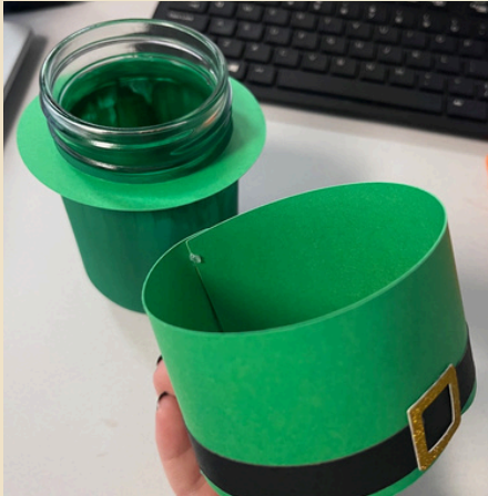
Step 3 & 4

4. Wrap the top hat portion around the jar to size, and glue/stick together accordingly. Make sure it's loose enough that it can easily slide on/off the jar.